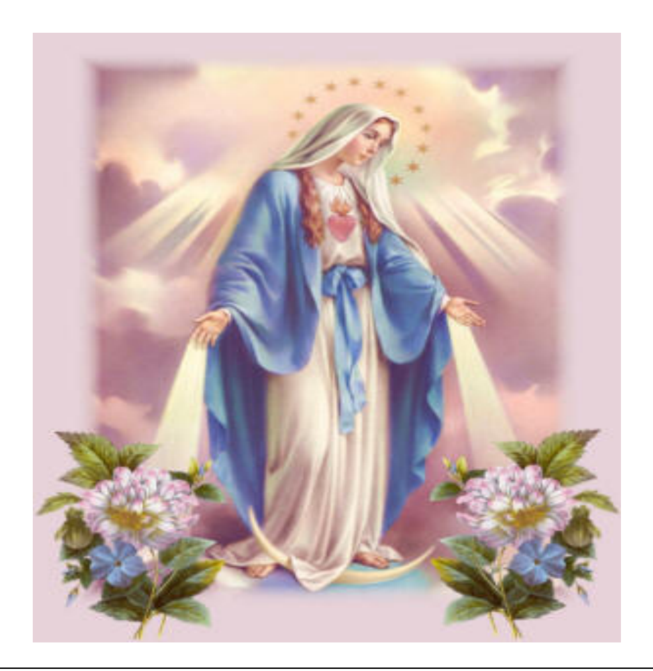
PRAY THE 6.30 AM CALL